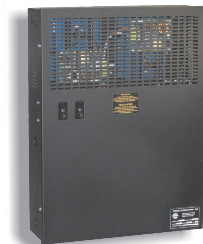
CLD-4K 4,000 Watt Automated Dimmer