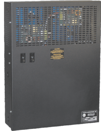
CLD-4K 4,000 Watt Automated Dimmer