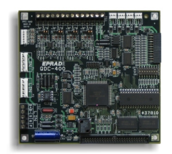
QDC-400 Dimmer Controller

The QDC-400 has four channels of line phase independent control. Each channel capable of driving two 2,000 watt dimmer modules.