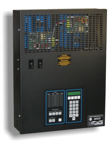
LCS-4K 4,000 Watt Automated Dimmer