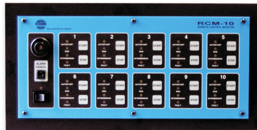
RCM-10 is a ten station remote control monitor which has all the features of a RSM-10 with Start and Stop capabilities for each auditorium.*