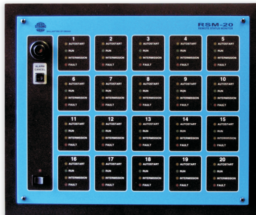
RSM-20 is a twenty station remote status monitor that has all the features of a RSM-10 but monitors up to 20 auditoriums.*